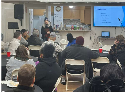
Hamden Meetup, December 2024